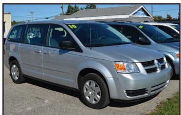
2010 DODGE GRAND CARAVAN SE Stow-N-Go, seats 7, 4 captain's chairs. AS LOW AS $299 A MONTH