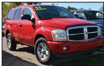
2004 DODGE DURANGO SLT 3rd row seat, tow pkg. AS LOW AS $199 A MONTH