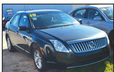
2010 MERCURY MILAN Air, cruise, nice. $9,995