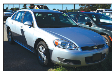
2010 CHEVY IMPALA Air, cruise, new tires, 29 MPG. $9,995