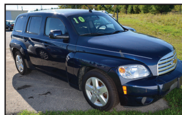
2010 CHEVY HHR Air, cruise, nice. $9,900