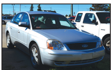
2005 FORD 500 Air, cruise, 4 new tires, Pioneer stereo. $7,995