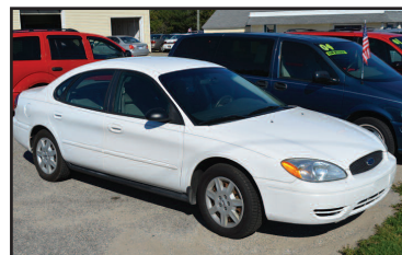
2006 FORD TAURUS SE Air, cruise. AS LOW AS $159 A MONTH