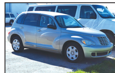
2006 CHRYSLER PT CRUISER Air, cruise. $6,995