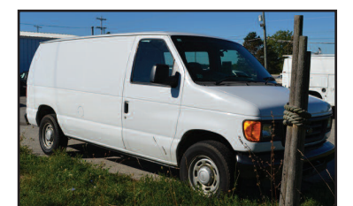
2005 FORD E-150 CARGO VAN. Great deal. $4,995

989 VFW RD., CHEBOYGAN, MI • 231-627-6700 • WWW.RIVERAUTO.NET