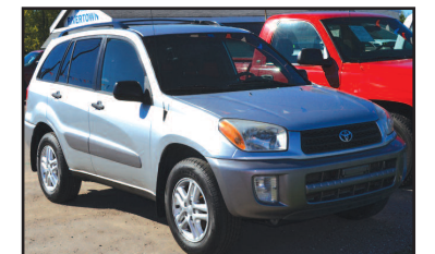
2002 TOYOTA RAV 4. 4X4, Air, cruise. AS LOW AS $149 A MONTH