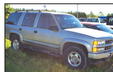
2000 CHEVY TAHOE Z-71 Leather, 4WD, tow pkg, low miles. $5,995 • $599 DOWN