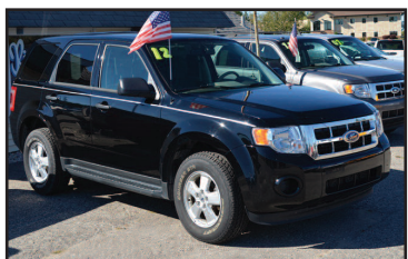
2012 FORD ESCAPE 4 new tires. AS LOW AS $239 A MONTH