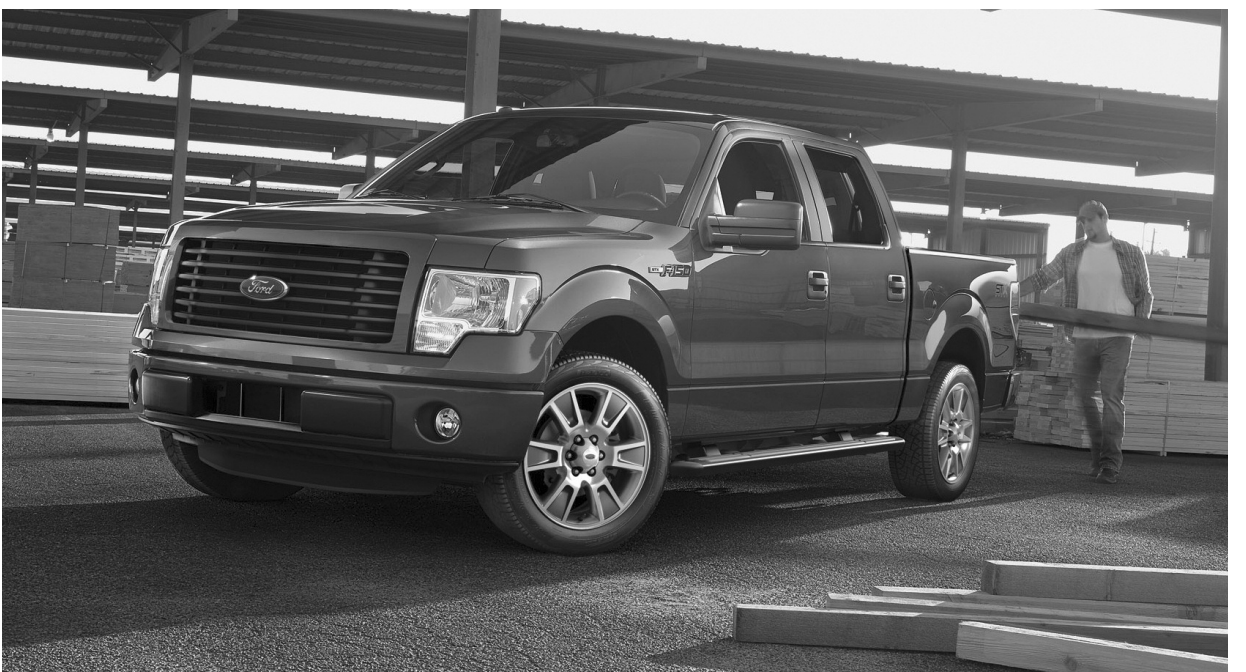
Ford, America's truck leader, adds the 2014 Ford F-150 STX SuperCrew® and STX Sport Package to its lineup, offering entry-level and value-oriented truck customers capable, roomy and stylish new options.