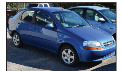
2005 CHEVY AVEO LS Auto, air, 35 MPG. $5,895