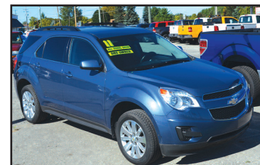
2011 CHEVY EQUINOX LT. AWD Very nice. AS LOW AS $249 A MONTH