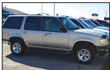
1998 FORD EXPLORER XLT 4x4, air, cruise. $2,995